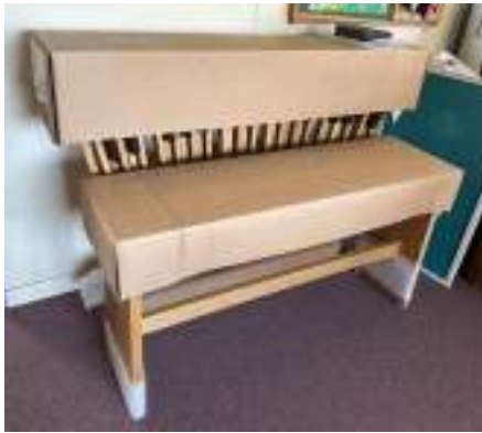
The new organ arrives.